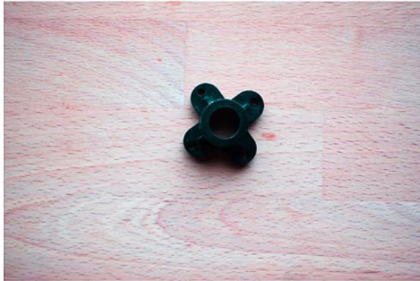
Inner Rod Clamp. Quantity 2. Properties: Glass fiber reinforced polycarbonate.