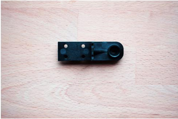
Support Riser Top. Quantity 2. Properties: Glass fiber reinforced polycarbonate.