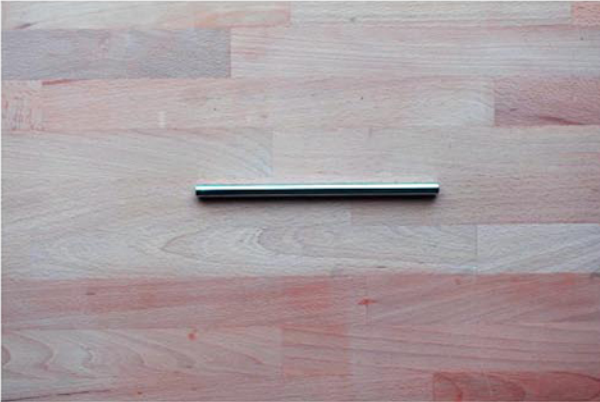
Linear Shaft. Quantity 2. Properties: Hardened steel.