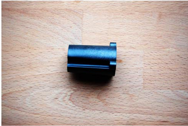
Inner Post. Quantity 8. Properties: Glass fiber reinforced polycarbonate.