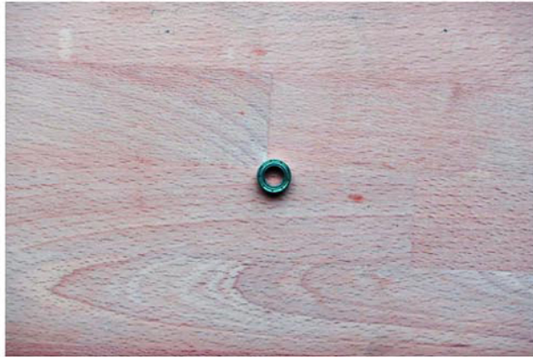
Bearing. Quantity 20. Properties: Fits 8mm shaft.