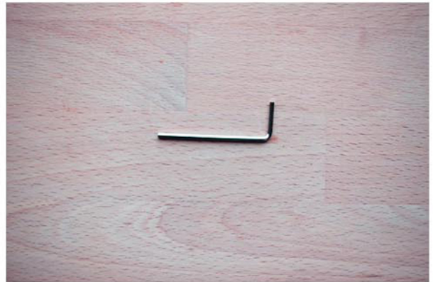
Allen Wrench. Quantity 1. Properties: Stainless steel.