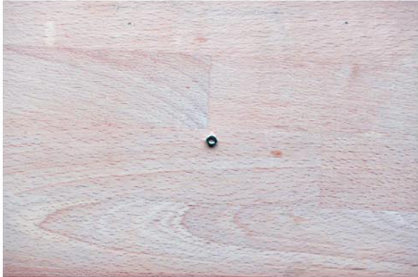
M3 Nut. Quantity 100. Properties: Stainless steel.