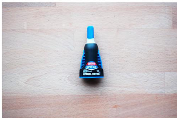
Super Glue. Quantity 1. Properties: Gel