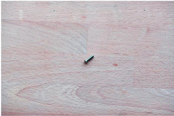
M3x12mm Bolt. Quantity 175. Properties: Stainless steel, 2mm allen drive button head.