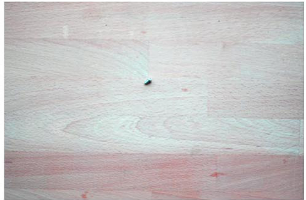
M3x6mm Bolt. Quantity 12. Properties: Stainless steel, 2mm allen drive button head.